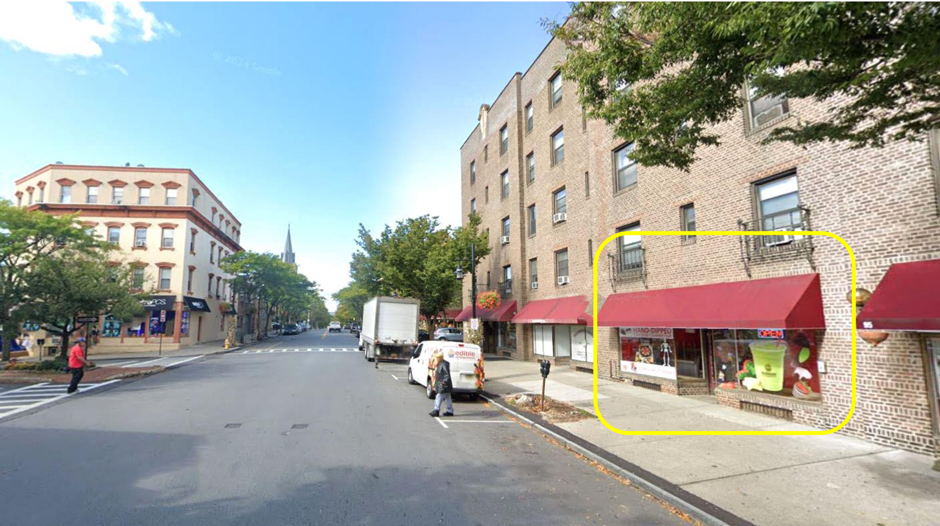
Facing West on Beekman Avenue