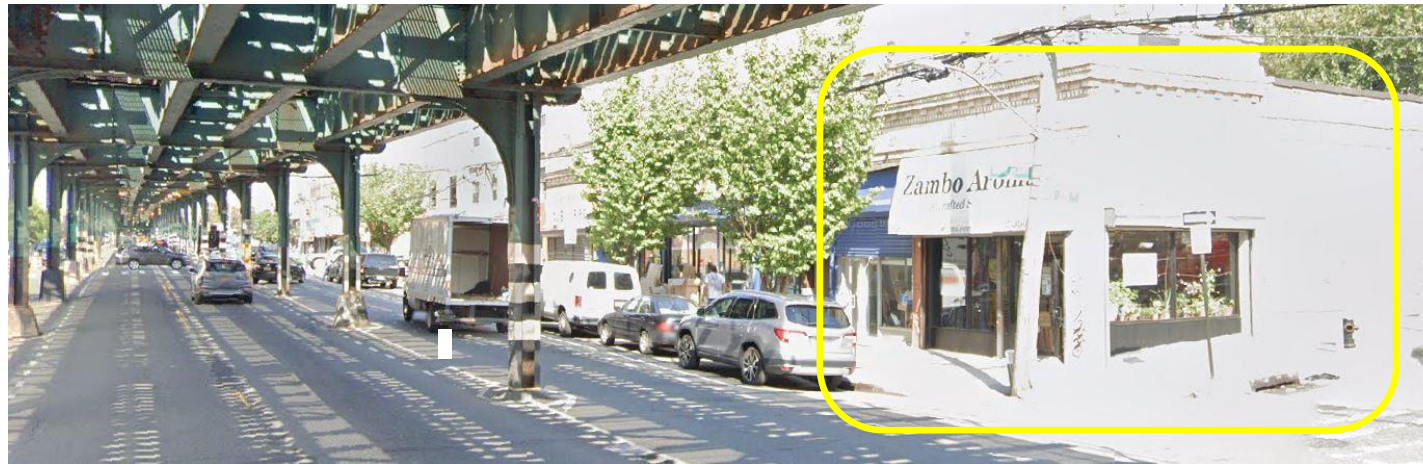
On White Plains Road facing northeast