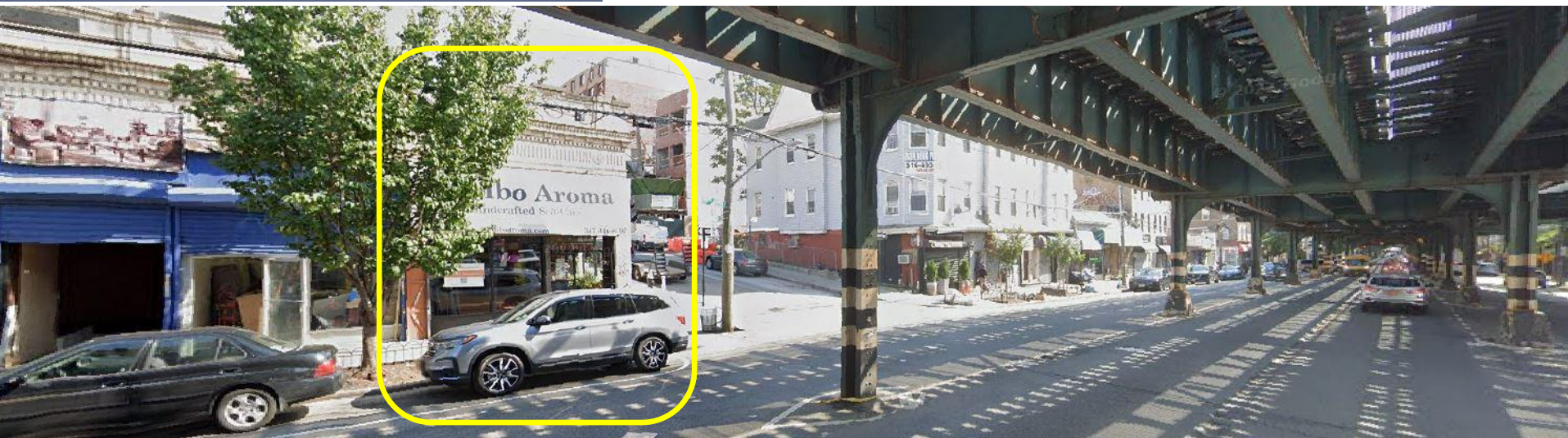
On White Plains Road facing southeast