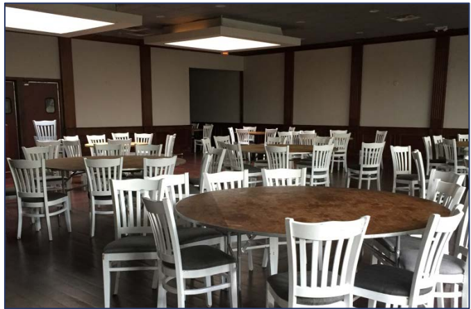
Private Party/Meeting Room