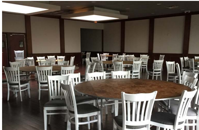
Private Party/Meeting Room